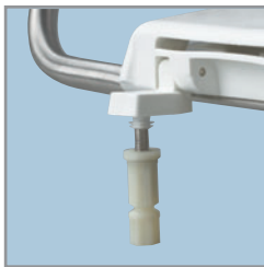
STA-TITE® COMMERCIAL FASTENING SYSTEM™