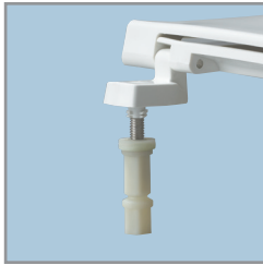
STA-TITE® COMMERCIAL FASTENING SYSTEM™