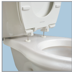
JUST•LIFT® PROVIDES 1-1/2" OF LIFT HEIGHT FOR ENHANCED CLEANABILITY