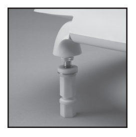
STA-TITE®, COMMERCIAL FASTENING SYSTEM™, ONE-PIECE INTEGRATED NUT AND WASHER