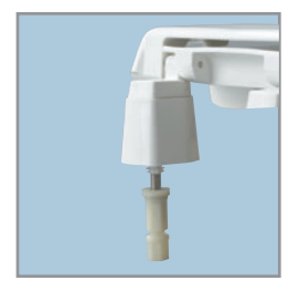
STA-TITE® COMMERCIAL FASTENING SYSTEM™