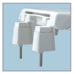
3" LIFT HINGES AND BUMPERS