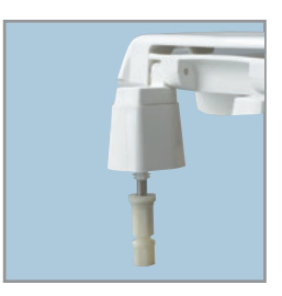
STA-TITE® COMMERCIAL FASTENING SYSTEM™