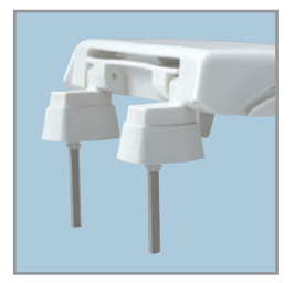
2" LIFT HINGES AND BUMPERS