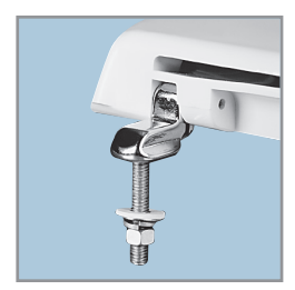
300 SERIES STAINLESS STEEL SELF-SUSTAINING HINGES (1950SS)