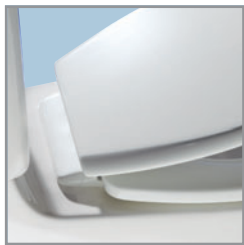
SECURE, STABLE MOUNT