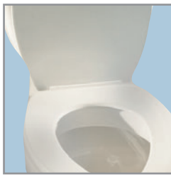
NO VISIBLE HARDWARE OR FASTENERS