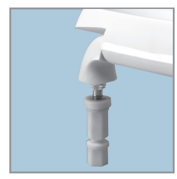
STA-TITE® COMMERCIAL FASTENING SYSTEM™