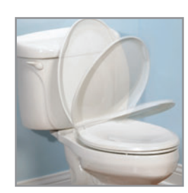
WHISPER • CLOSE® FEATURE