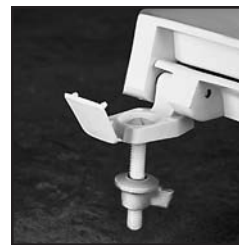
TOP-TITE® HINGES FEATURE NO-SLIP WASHER

Ring thickness is 11/16" Ring thickness including the bumper is 15/16" Height of the seat with cover is 2-9/16"