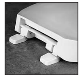
“LOCKED-IN” TOP-TITE® HINGE