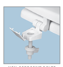
NON-CORROSIVE BOLTS AND WING NUTS