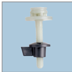
NON-CORROSIVE BOLTS AND WING NUTS