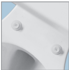
EASY REMOVAL OF SEAT FOR THOROUGH CLEANING