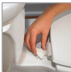
TWIST HINGES TO UNLOCK