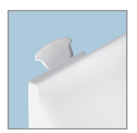
PLASTIC EASY•CLEAN & CHANGE™ HINGES