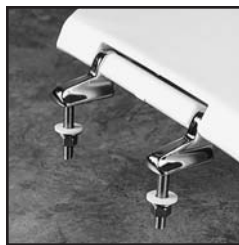
CP HINGE MADE OF CHROME-PLATED BRASS

Ring thickness is 7/8" Ring thickness including the bumper is 23/32" Height of the seat with cover is 2"