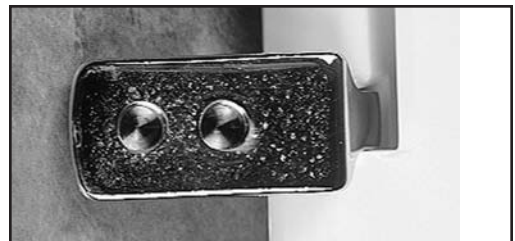
TWO-POSITION HINGE FITS EITHER ROUND OR ELONGATED BOWLS

** ANSI Z124.5 section 5.1.2 Tests have shown that this product will support weights up to 500 pounds.** (Contact Bemis Mfg. Co., for test data)